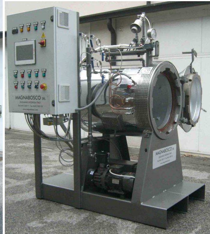
Autoclave Ø 500 x 500 a 30 BAR