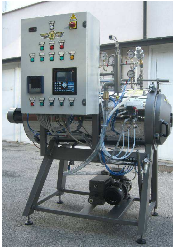
Autoclave Ø 500 x 1000 a 12 BAR