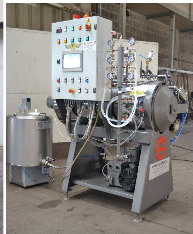
Autoclave Ø 500 x 750 a 12 BAR Autoclave Ø 450 x 800 a 10 BAR