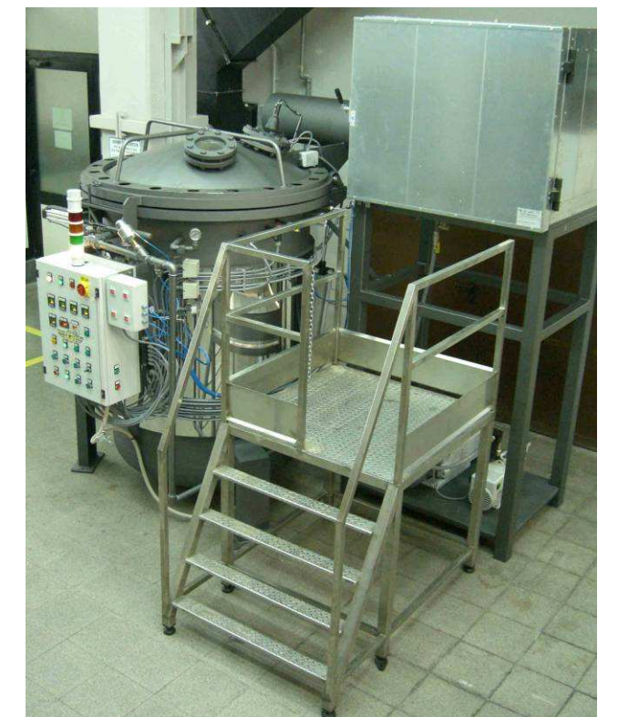
Autoclave Ø 1200 x 1500 a 25 bar 400 °C