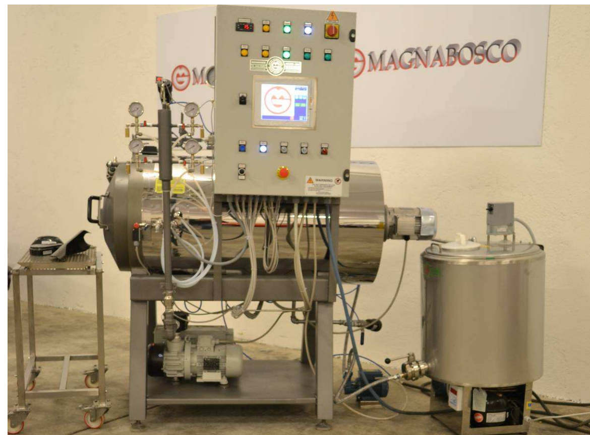
Autoclave Ø 650 x 1000 a 15 BAR a 250 °C