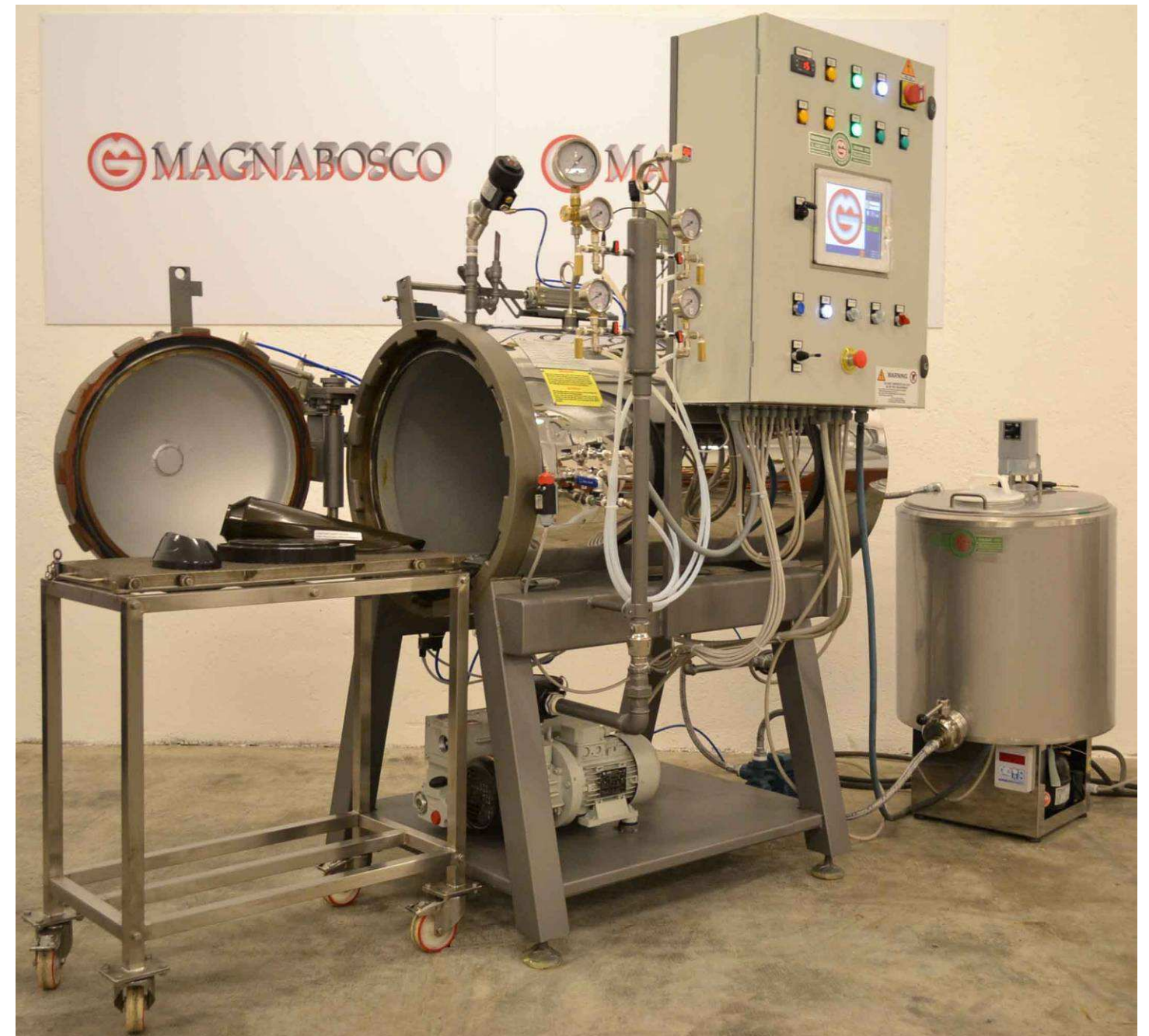
Autoclave Ø 650 x 1000 a 15 BAR a 250 °C Completa di impianto di raffreddamento acqua a circuito chiuso e carrello porta vassoio.

MAGNABOSCO S.r.l. - Via Roma, 19 – 36030 Zugliano (VI) Tel. 0445 330111 • Fax 0445 330110 e-mail: magnabosco@magnabosco.com • www.magnabosco.com